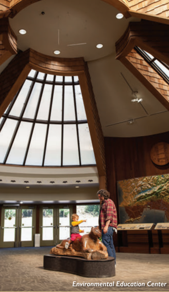
Environmental Education Center